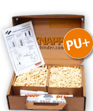
KNAPP® DOWEL Box

KNAPP®-ADHESIVES are also included in the following boxes: