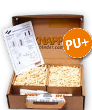
KNAPP® DOWEL Box

KNAPP®-ADHESIVES are also included in the following boxes: