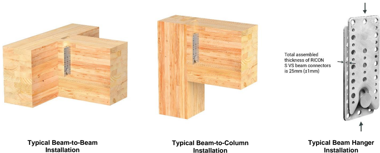
FIGURE 2—RICON S VS SERIES BEAM HANGER INSTALLATION