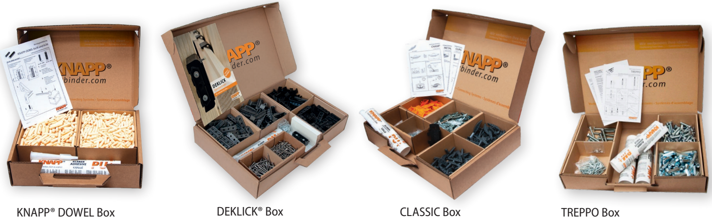
KNAPP® DOWEL Box

KNAPP®-ADHESIVES are also included in the following boxes: