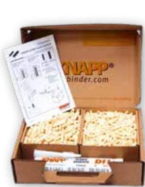
KNAPP® DOWEL Box

KNAPP®-ADHESIVES are also included in the following boxes: