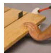
Mount the final board