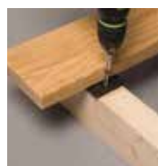
Fasten to the joists with screws