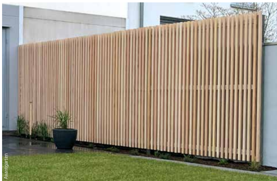
Garden fence with UNO 30 and TUCK