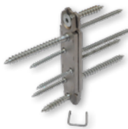
RICON® Stainless steel A2