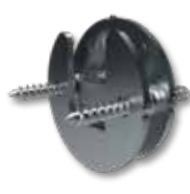
DUO 30 Stainless steel A5