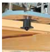
Routing with the router (optional)