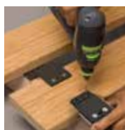
Pre-drill with the template