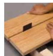
Use QUATRO 65 as spacer