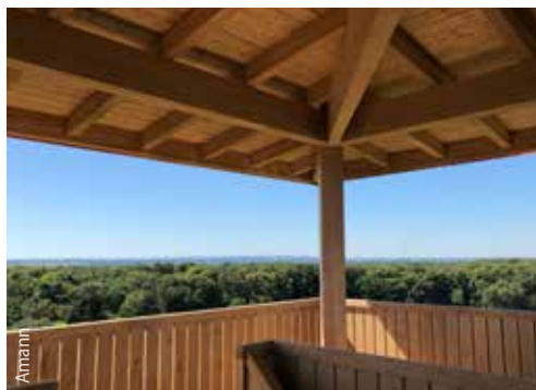
Goetheturm in the Frankfurt-Sachsenhausen city forest