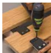
Fasten to the boards with screws