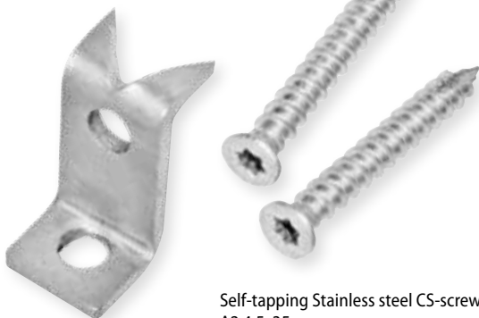
Self-tapping Stainless steel CS-screws A2 4,5x35 mm