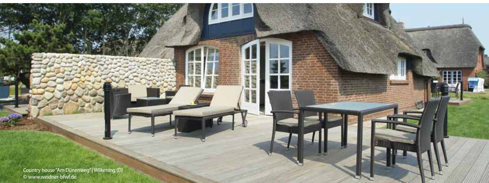
Country house "Am Dünenweg" | Wilkening (D) © www.weidner-bfww.de