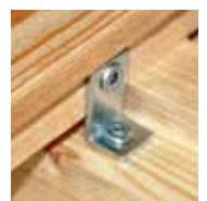
The Z-DECK is completely mounted