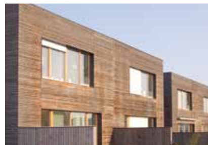
Wooden facades with UNO 30