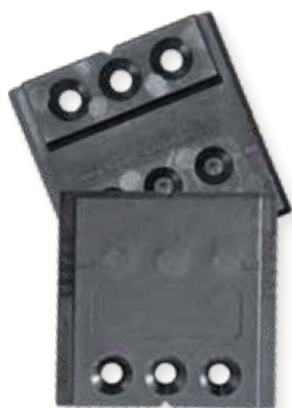
QUATRO 65/25 Art.-NO. K081

Recommended for spacing no smaller than 7 mm