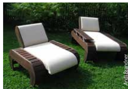
Garden furniture with KNAPP®-DOWEL