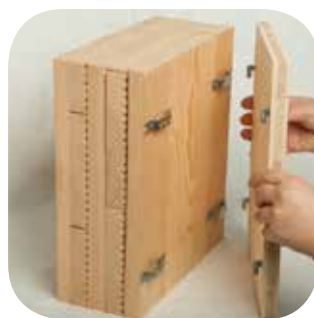
Simply hook in the components