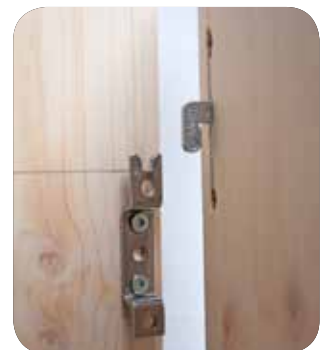
KOMBI biscuit connector to vertically mounted holding bracket