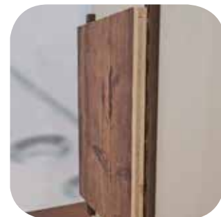
Mount the component to the perforated rails