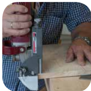
Milling the component with biscuit cutter (depth setting 10 mm)