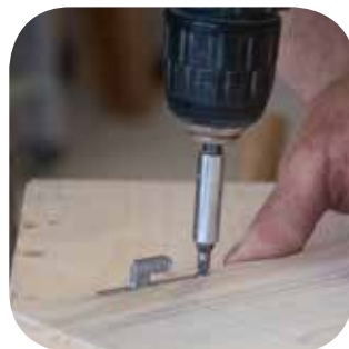
Insert and screw on or glue