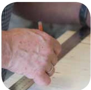
Set the position for the biscuit cutter