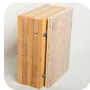
Ready to mount, and can be de-mounted at any time