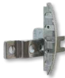
KOMBI to holding bracket horizontally