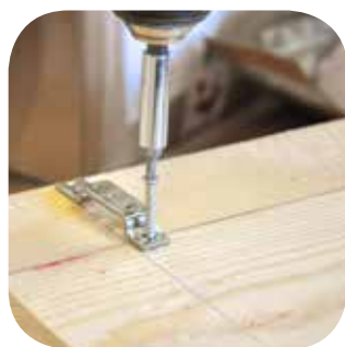
Screw KOMBİ holding bracket to the component